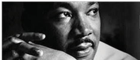
Martin Luther King Jr. Day

Lindenwood University is currently conducting a research study about the post-high school experiences of Concept alumni. The purpose of the study is to learn more about the alumni we serve so we can focus on what they need most. Last week CAN sent an online survey to all Concept alumni, and their answers will be an important part of the study data. Surveys are due March 1, after which interviews of several Concept alumni will be conducted. We look forward to sharing our findings and future plans.